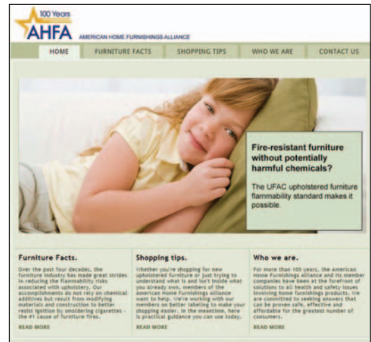
An AHFA consumer website was launched in November to answer the public’s questions about FR chemicals.