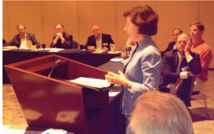
U.S. Consumer Product Safety Commission Chairman Inez Tenenbaum addressed the AHFA Board in May.