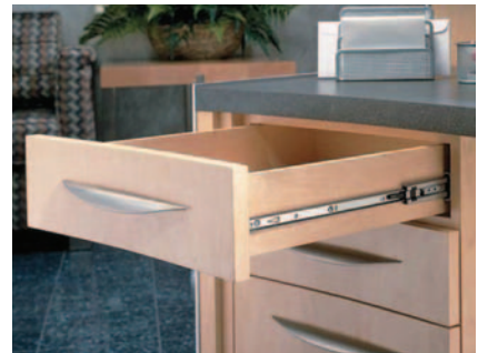
Clothing storage chests and dressers with "full extension" drawers, similar to this kitchen cabinet drawer, will be impacted by the revised ASTM Furniture Tip-Over standard in 2014.