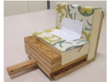
The new TB 117-2013 flammability standard focuses on smolder tests conducted on small mock-ups of upholstered furniture.

AHFA provided key technical advice to California officials in 2013 as they raced to complete revisions to the 35-year-old flammability standard known as TB 117. California Bureau Chief Tonya Blood outlined the new rule for AHFA members during the February Sustainability Summit in Charlotte, N.C. The new standard focuses on three tests to evaluate the cigarette ignition resistance of upholstery cover fabrics, barrier materials and filling materials. AHFA offered technical advice on the regulatory language within the standard through public comments filed on behalf of several industry stakeholder associations.