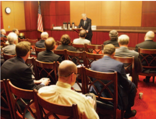
Representative Alan Nunnelee (R-MS) was among legislators who addressed AHFA's Board of Directors at a government affairs meeting in Washington, D.C., in May.

AHFA launched 2014 with an aggressive membership outreach campaign designed to connect with leading manufacturers and importers. A complete revision of the Alliance's website, www.ahfa.us , was expected to be finished in early spring, helping to extend AHFA's reach among new audiences.